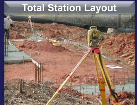
Total Station Layout

Superior Quality .... at Production Prices