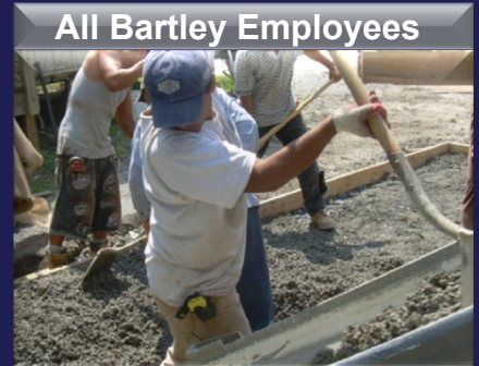
All Bartley Employees